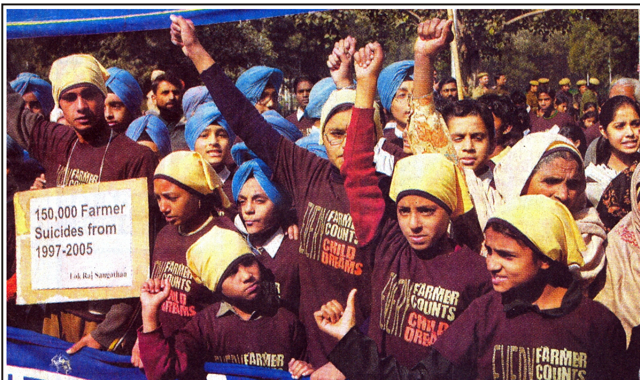
SEEKING AN END TO AGONY : Family members, including children, of Punjab farmers who committed suicides, protest in New Delhi against the "anti-farmer" policies of the Central and Punjab governments. The farmers ended their lives owing to mounting debts and harassment from moneylenders.